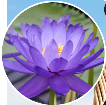
Flower of the Month Water Lily